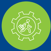
Support & Field Services